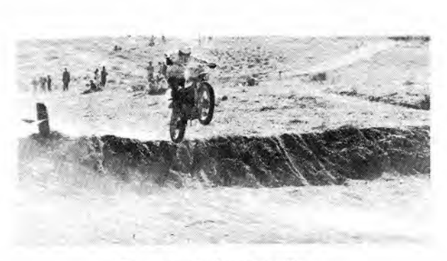
One way to learn to fly.

We asked Dorothy if the club had terrorized any citizens lately, a la Hell's Angels. "Not yet," she replied, "but given enough dumb questions like that, who knows. . "The air seemed a little heavy with menace, so we backed out before things deteriorated further.